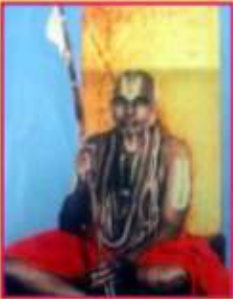
HH 43RD JEER