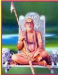
HH 44 TH JEER