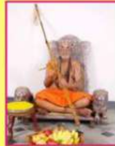
HH 45 TH JEER